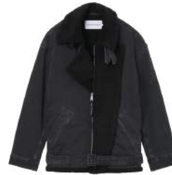
● OVERSIZED SHERPA MOTO DENIM JACKET