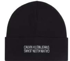
● MIRROR LOGO BEANIE