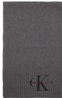
● ● KNITTED BASIC MEN SCARF