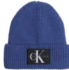
● ● ● ● ● MONOGRAM BEANIE WOOL