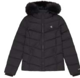
● SHORT FITTED DOWN PUFFER