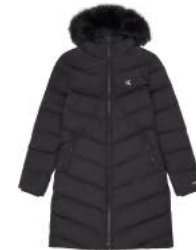
● LONG FITTED DOWN PUFFER