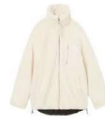
● SHERPA JACKET