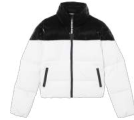
● GLOSSY BLOCKER PUFFER JACKET