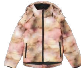
● OVERSIZED BLURRED PRINT PUFFER