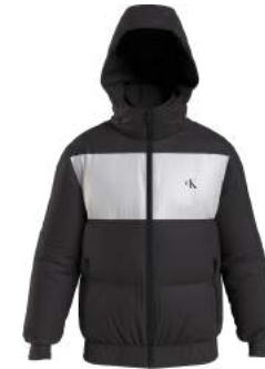
● COLORBLOCKED SPLICED CK PUFFER