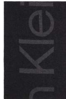
● DRY BRANDING KNIT SCARF 30X180 CM