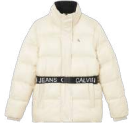
● LONG BELT WAISTED SHORT PUFFER