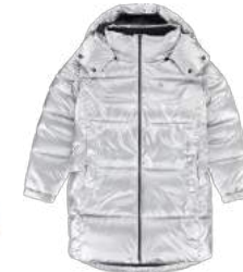
● COCOON OVERSIZED SILVER JACKET