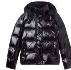
● HIGH SHINE SHORT PUFFER