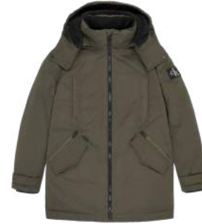
● SHERPA LONG PARKA