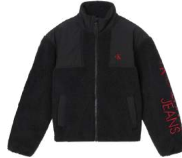
● SHERPA JACKET