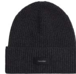
● DADDY WOOL RIB BEANIE