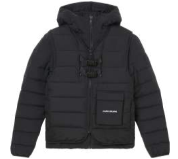
● 2 IN 1 URBAN PUFFER JACKET