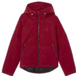
● ● SOFT TOUCH PUFFER JACKET