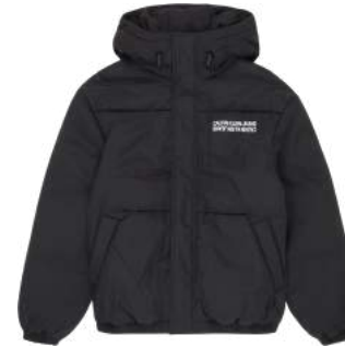
● CRIKLE PUFFER