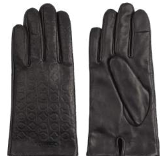
● MONOGRAM LEATHER GLOVES