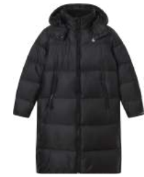
● DOWN SHINNY LONG PUFFER